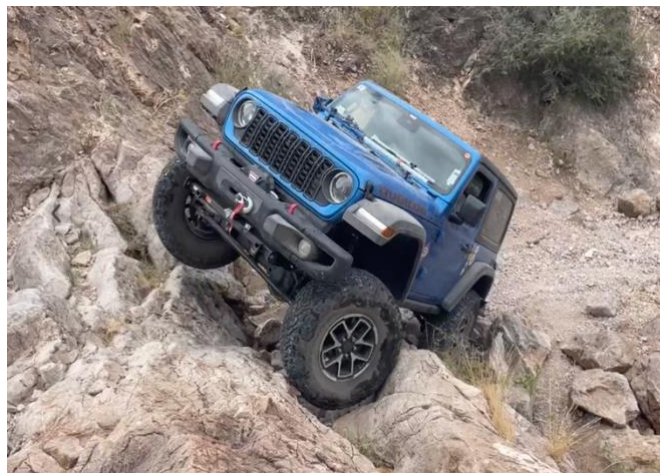
Crystal Canyon #3