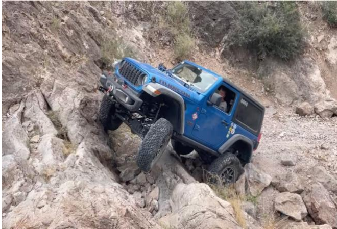
Crystal Canyon #2