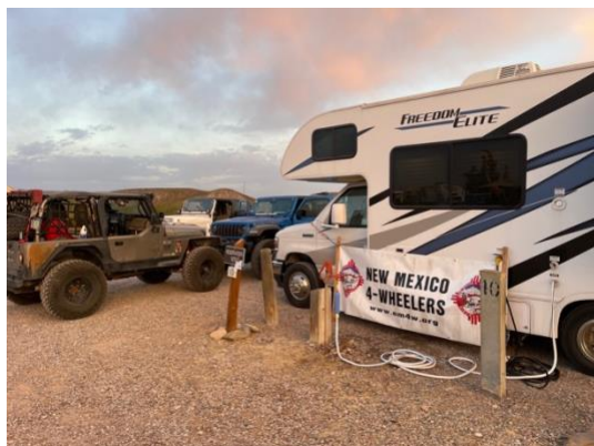
Camping with Jeeps! :-)

LC4WDC did great job offering a blend of trail difficulties providing challenges when desired and "chillaxing" a bit more when wanted.