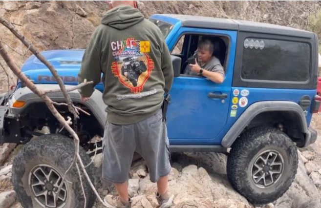
Crystal Canyon #6