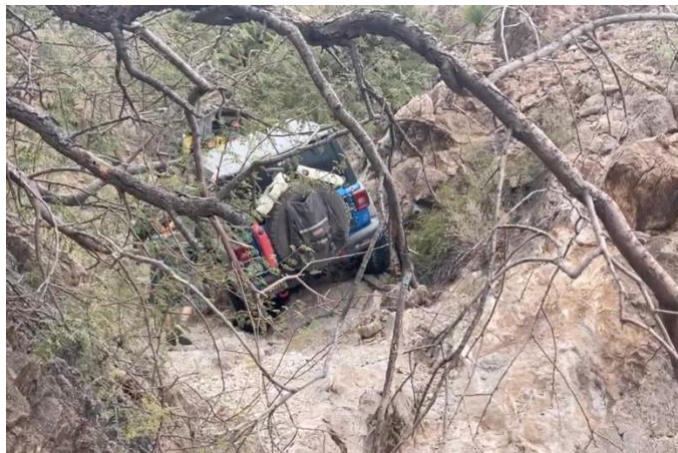
Crystal Canyon #9