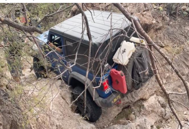
Crystal Canyon #8

I want to give a huge shout out to the men I run trails with who honor me as a capable, woman 4-Wheeler. 30+ years ago, when I started in this sport, I was a total unicorn. Women usually only rode in the passenger seat, and very rarely drove. In my first four Jeeps, I shared the driver's seat with a husband. For years, I was often the only woman driver. On any run anywhere.