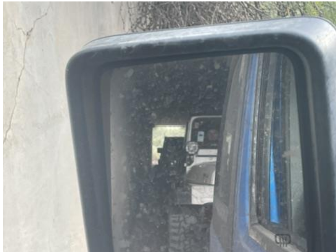
Access to Crystal Canyon meant going through a tunnel under the highway. :-)

We had fabulous LC4WDC Trail Leaders and spotters on ‘Ol Skool – they helped make it a great day! Sadly, because my brain went into trauma mode prior to tackling the boulder garden, I didn’t manage to hand off my phone to anyone to get pictures or videos. Humorously, while I was maneuvering through it, I heard someone shout, “OMG, we should’ve gotten that on video!!!” :-P