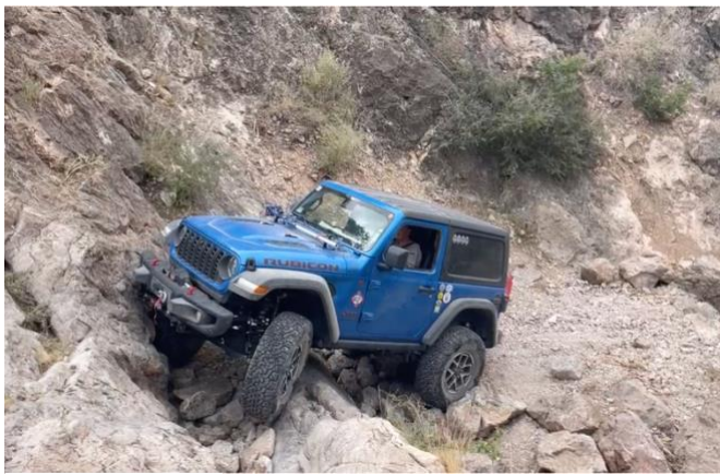
Crystal Canyon #1