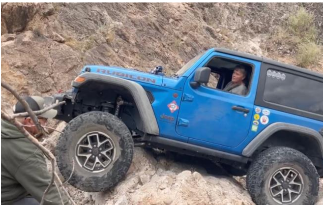
Crystal Canyon #5