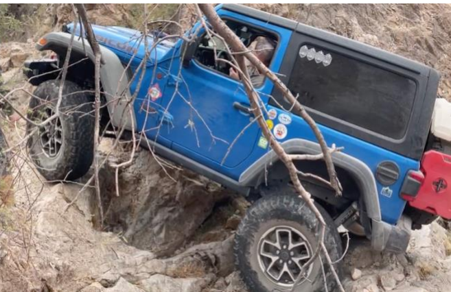
Crystal Canyon #7