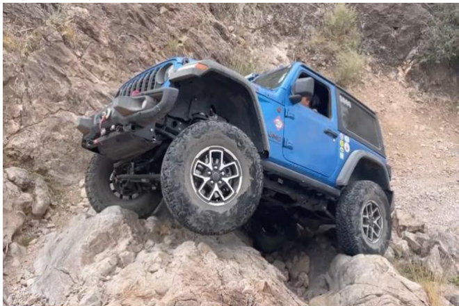
Crystal Canyon #4

Crystal Canyon gave me the thrill of making it up the single hardest obstacle I've ever tackled. Right at the beginning of the trail, you find the element that gives Crystal Canyon, the + part of its 7+ rating. Essentially, a 2-story series of waterfall ledges, with boulders jutting out and tight, wonky turns throwing you seriously off-camber. There's no bypass – once you're on the trail, you're committed. By the end of that obstacle, I was pretty sure I should be committed, LOL.